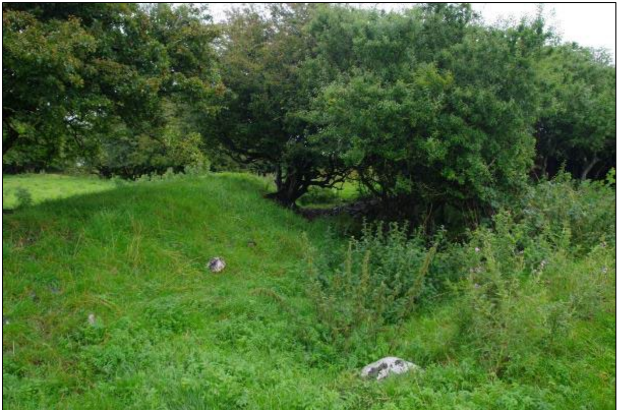
Plate 15.13: View of interior of Ringfort GA028-040---- from east