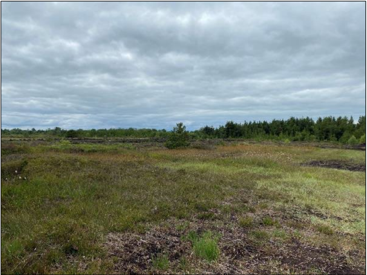
Plate 15.9: View of location of Turbine 10 from south