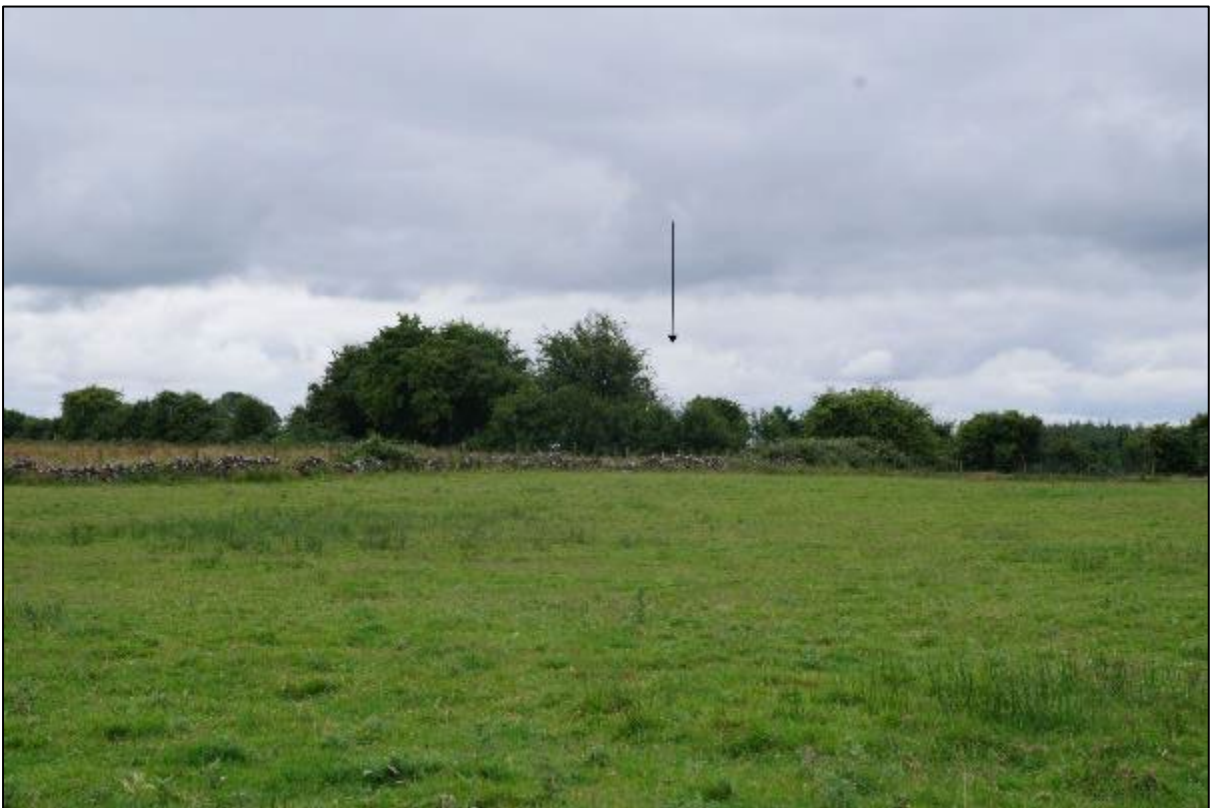
Plate 15.12: General view of location of Ringort GA028-040---- from north (indicated with arrow