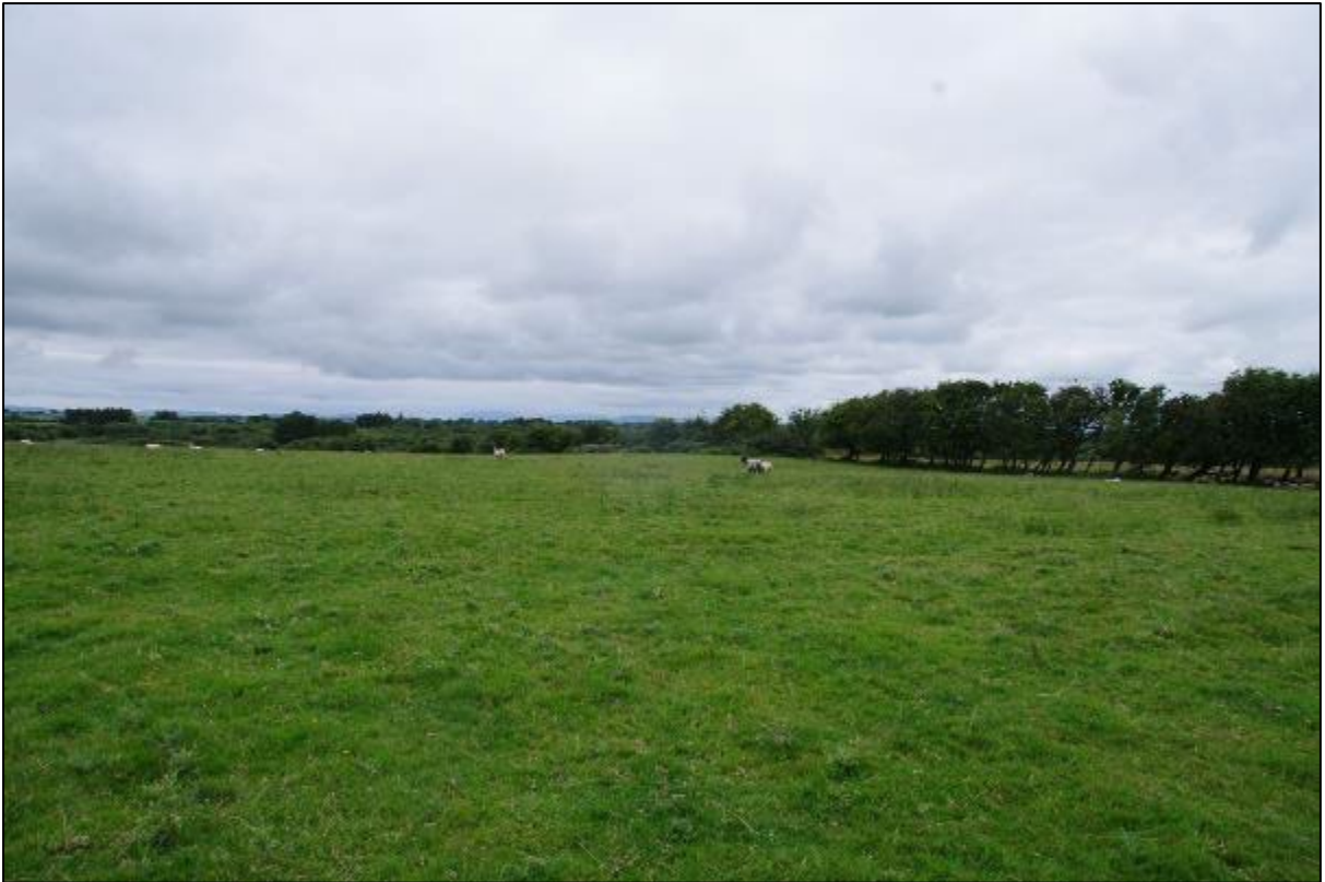
Plate 15.3: View of location of Turbine 3 from southeast