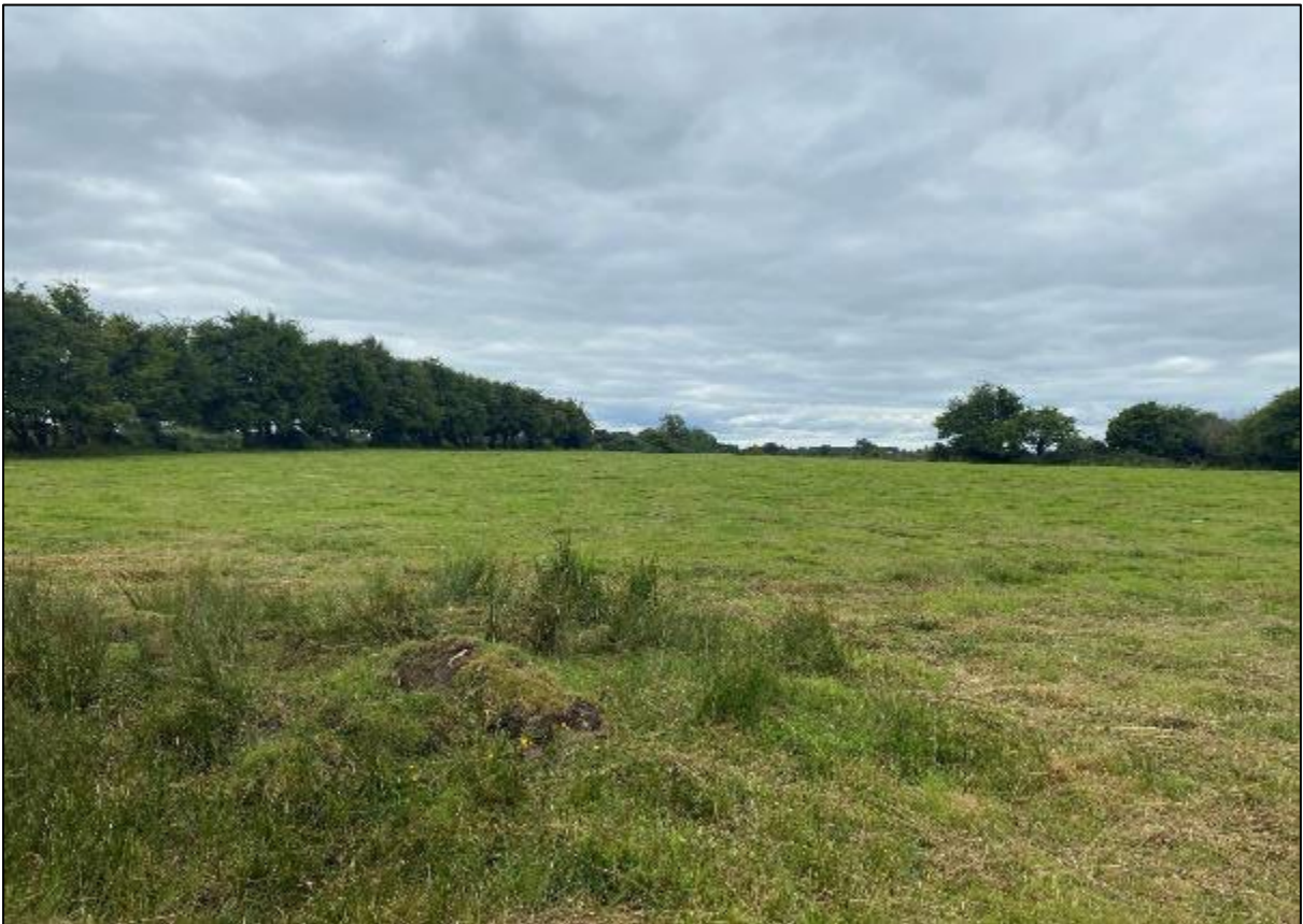
Plate 15.8: View of location of Turbine 9 from north