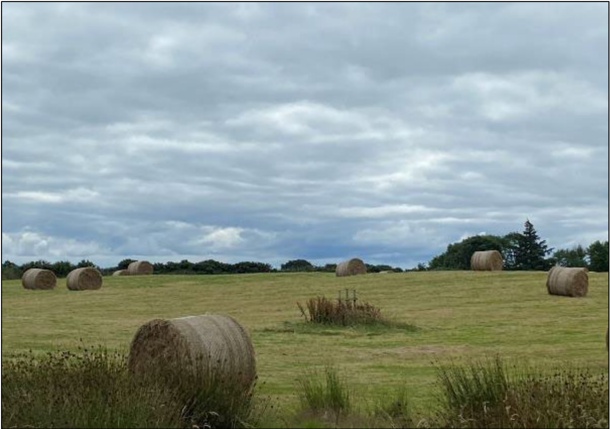
Plate 15.7: View of location of Turbine 8 from north