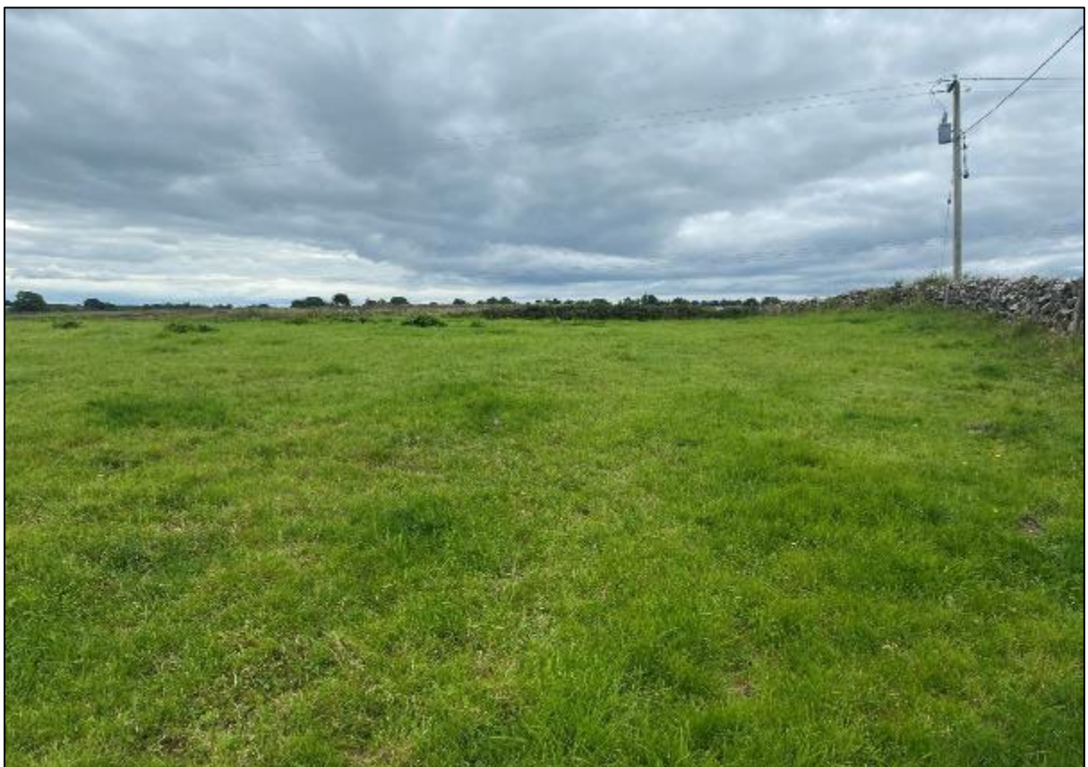
Plate 15.14: View of levelled Cashel GA028-046---- (containing potential burial ground GA028-04601) from north (at Loop-in)