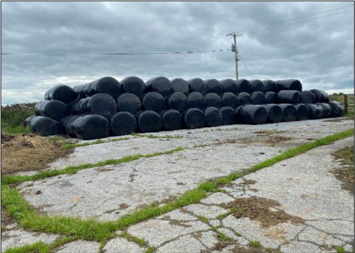
Plate 15.15: View of modern farmyard surface in GCR area to west of Cashel GA028-046----