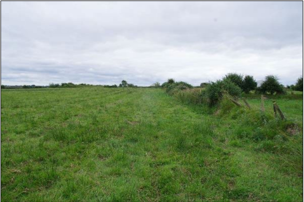
Plate 15.5: View of location of Turbine 6 from north