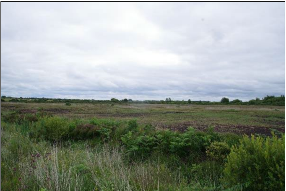
Plate 15.6: View of location of Turbine 7 from west