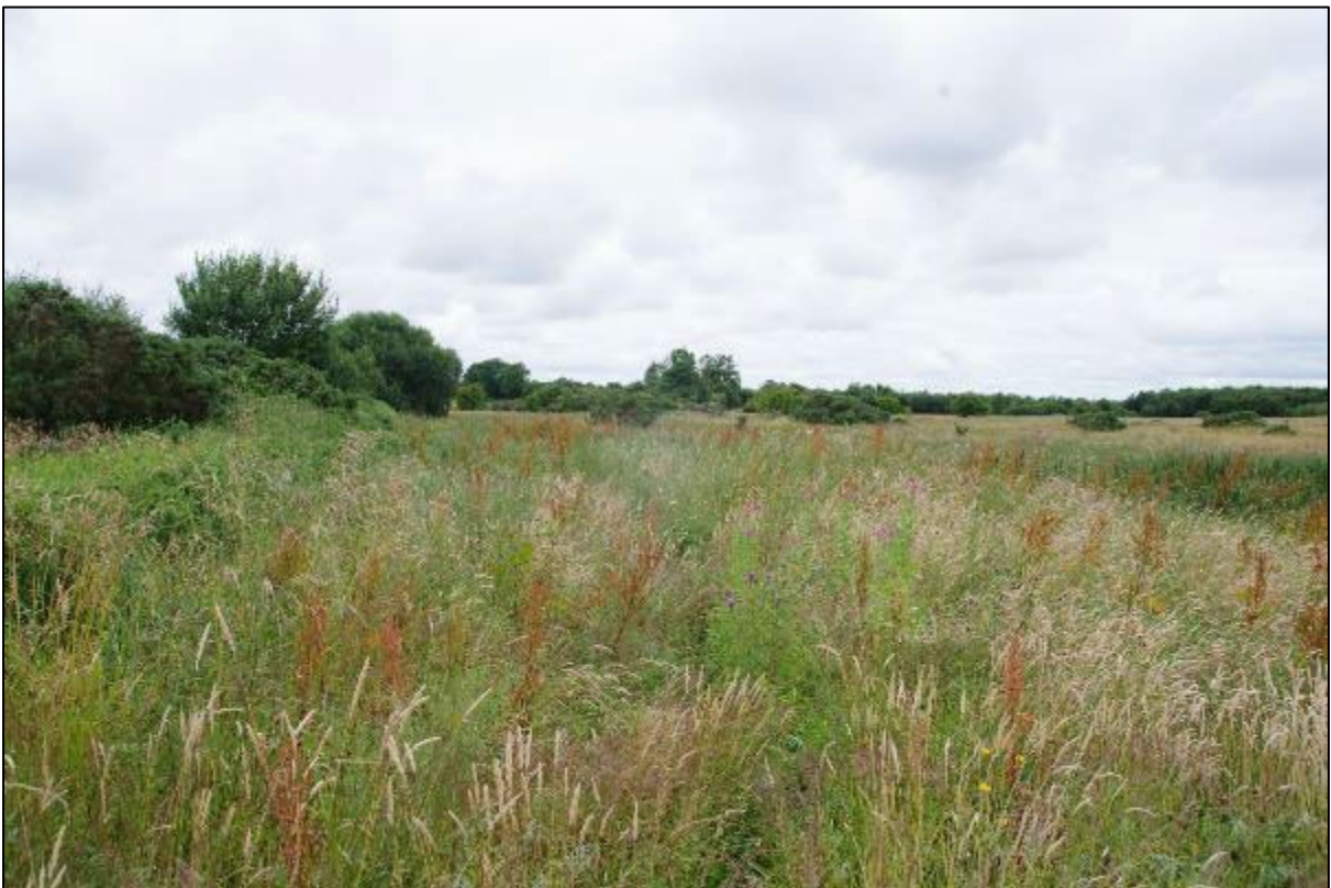
Plate 15.2: View of location of Turbine 2 from south