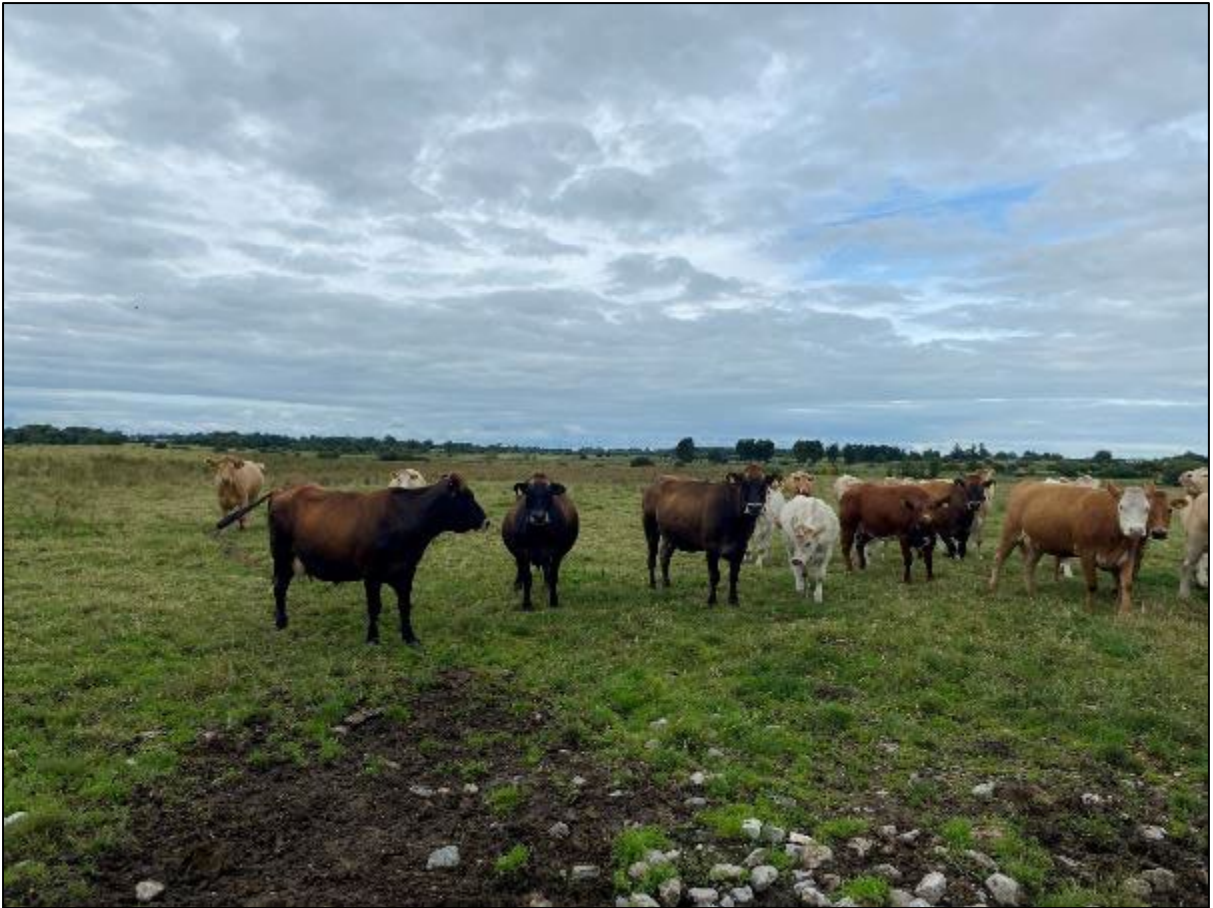
Plate 15.16: View of substation location from south