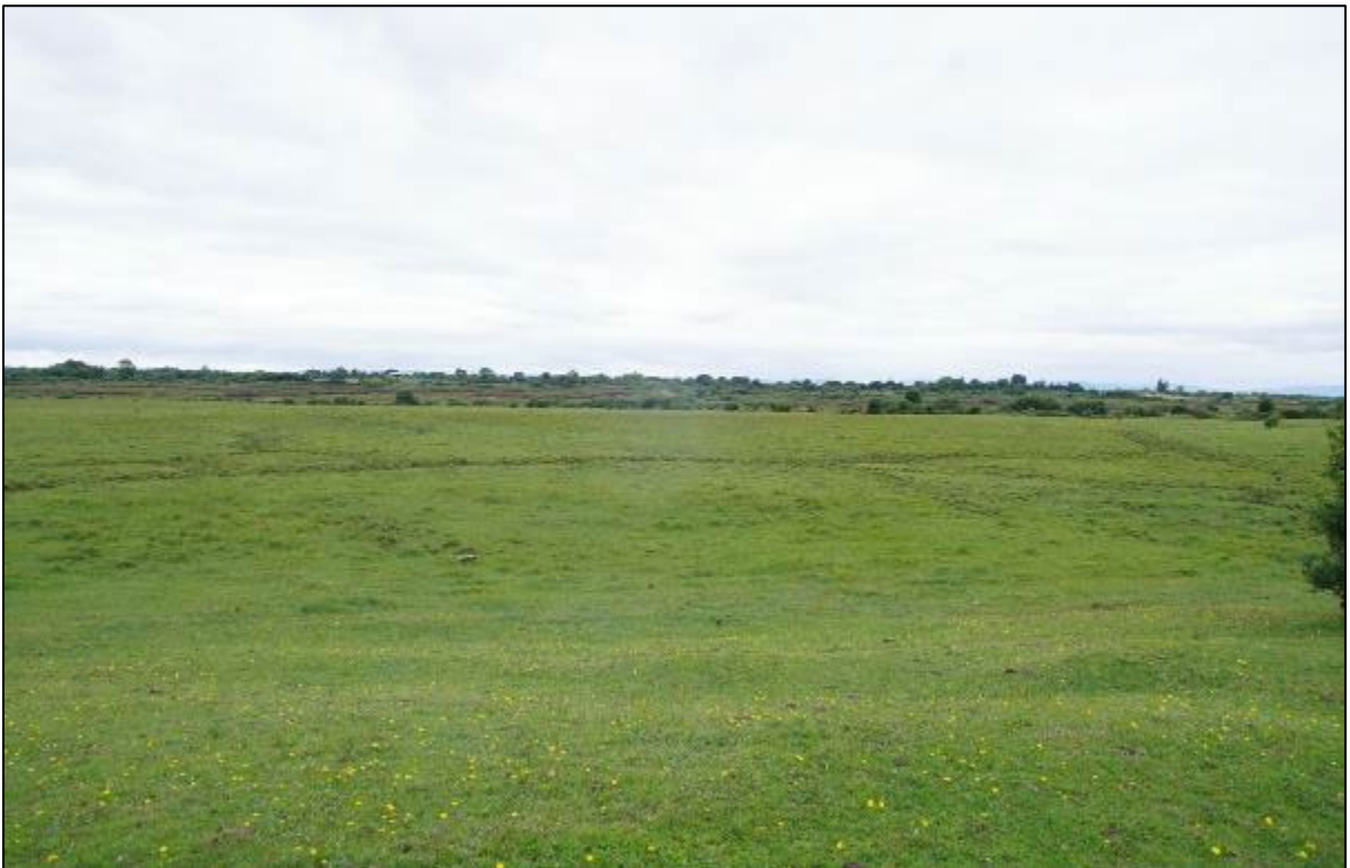
Plate 15.10: View of route of access road to Turbine 11 from east