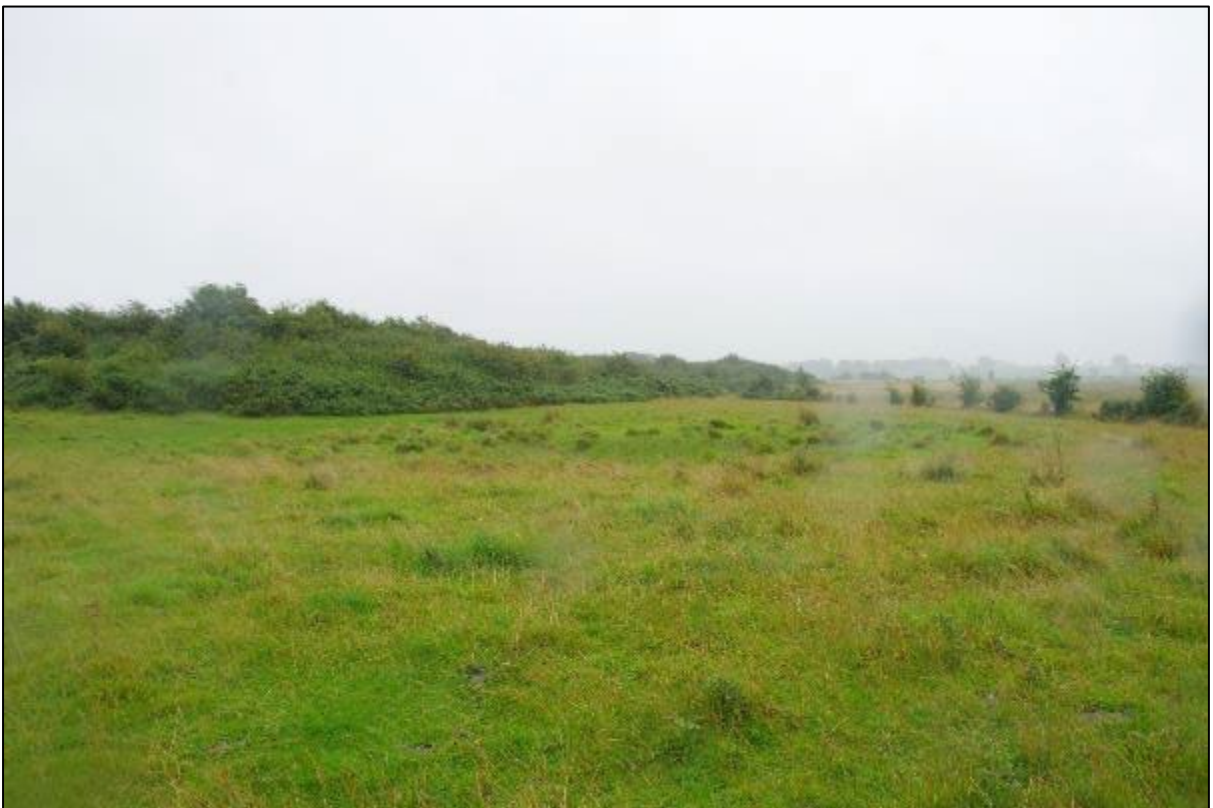
Plate 15.4: View of location of Turbine 4 from west

Note: Turbine 5 - photograph of location was not saved on HD card