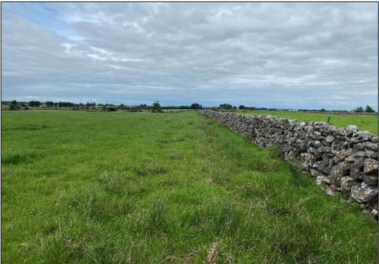
Plate 15.16: View of GCR route from south