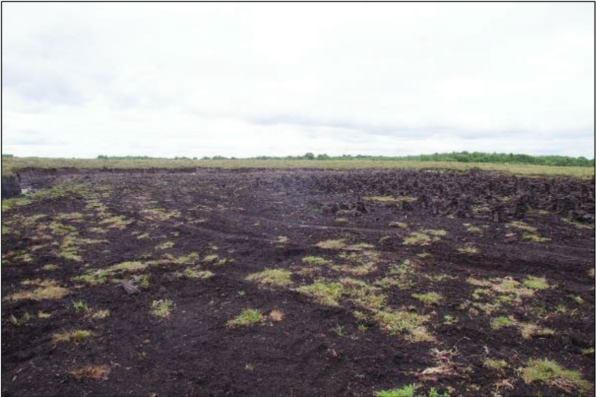
Plate 15.11: View of location of Turbine 11 from south