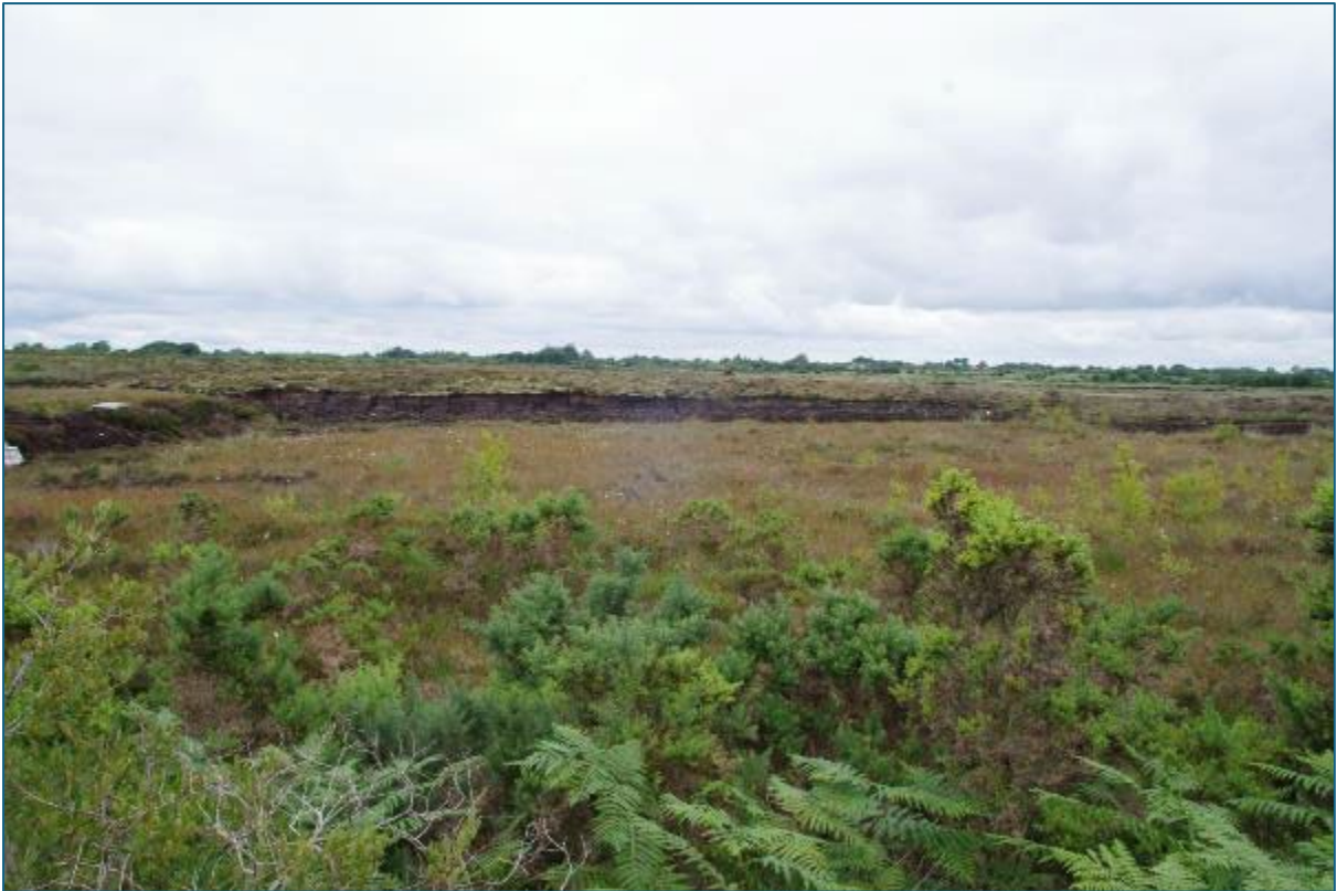
Plate 15.1: View of location of Turbine 1 from west